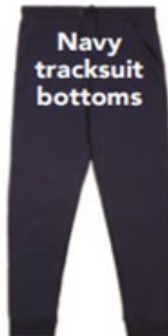
Navy tracksuit bottoms