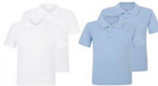
White or light blue polo shirt